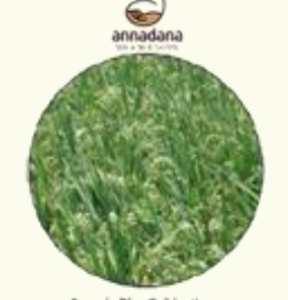
Organic Rice Cultivation

Content: Importance – Origin and distribution – Area and Production – Growth stages – Climate – Season – Crop duration – Soil – Seed rate – Cultivation techniques – Nursery – Seed treatment – Sowing – Biofertilizer application – Main field preparation techniques – Transplanting – Spacing – Weeding – Irrigation – Nutrient management – Crop critical stages – After care and agronomical practices – Harvesting – Cleaning – Storage.